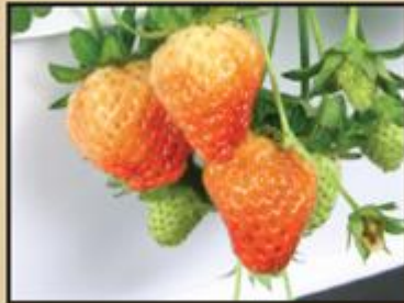
Underripe – fruit is still green and/or light red.

A strawberry is ready for picking when it is bright red all over. Your strawberries will be their sweetest when picked at just the right time.