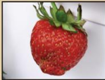
Overripe Stage –darker/dull red and some browning.

Once you've determined that a strawberry is ripe and ready to harvest, here's what to do: