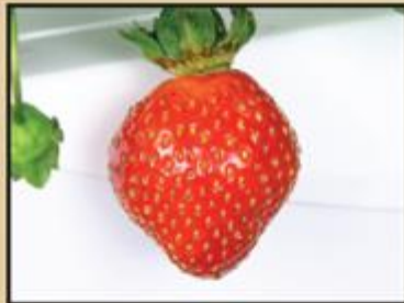
Ripe Stage – bright red and shiny.